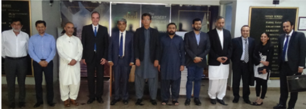
ABAD office-bearers pictured with Asian Development Bank delegation after a meeting at ABAD House.

The Asian Development Bank delegation offered loan to ABAD for construction of homes