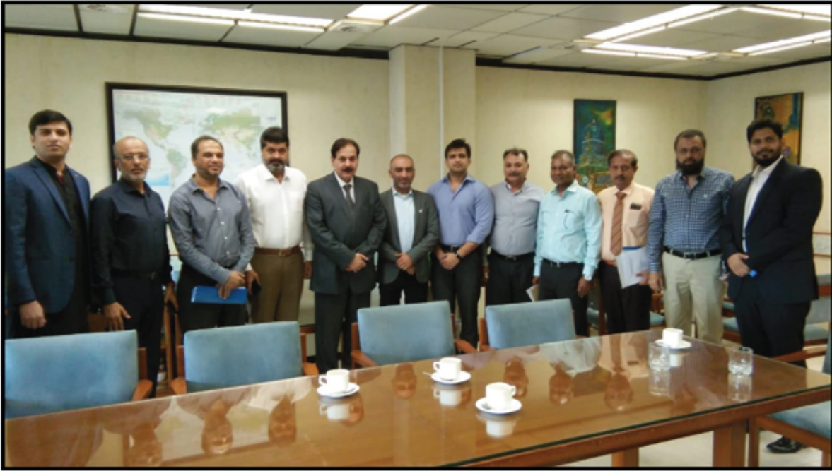
ABAD delegation after a meeting with CEO K-Electric at his office.