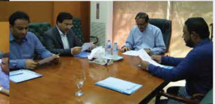
The newly-elected CEC and REC members for the term 2018-19 are taking oath.

team work was essential to reach the heights of success. He also said to the other members that “those who couldn’t be elected as members of CEC or REC are still part of our team and could be elected in future.”