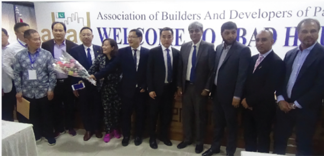
A group photo of ABAD high-ups with a visiting trade delegation from China at ABAD House.

The Diplomatic Affairs Sub-Committee of ABAD is one of the core committees of the Association tasked with building the image of ABAD, nationally and internationally.