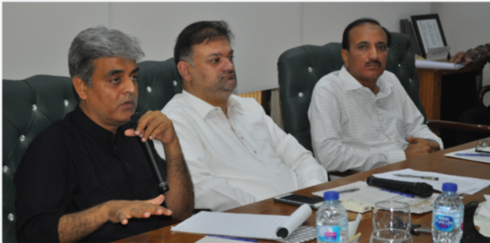
FBR Sub-Committee holds a meeting at ABAD House.

The tenure for the term 2019-20 witnessed a number of issues related to taxation and amnesty schemes as well as government's asset declaration ordinance for the business sector.