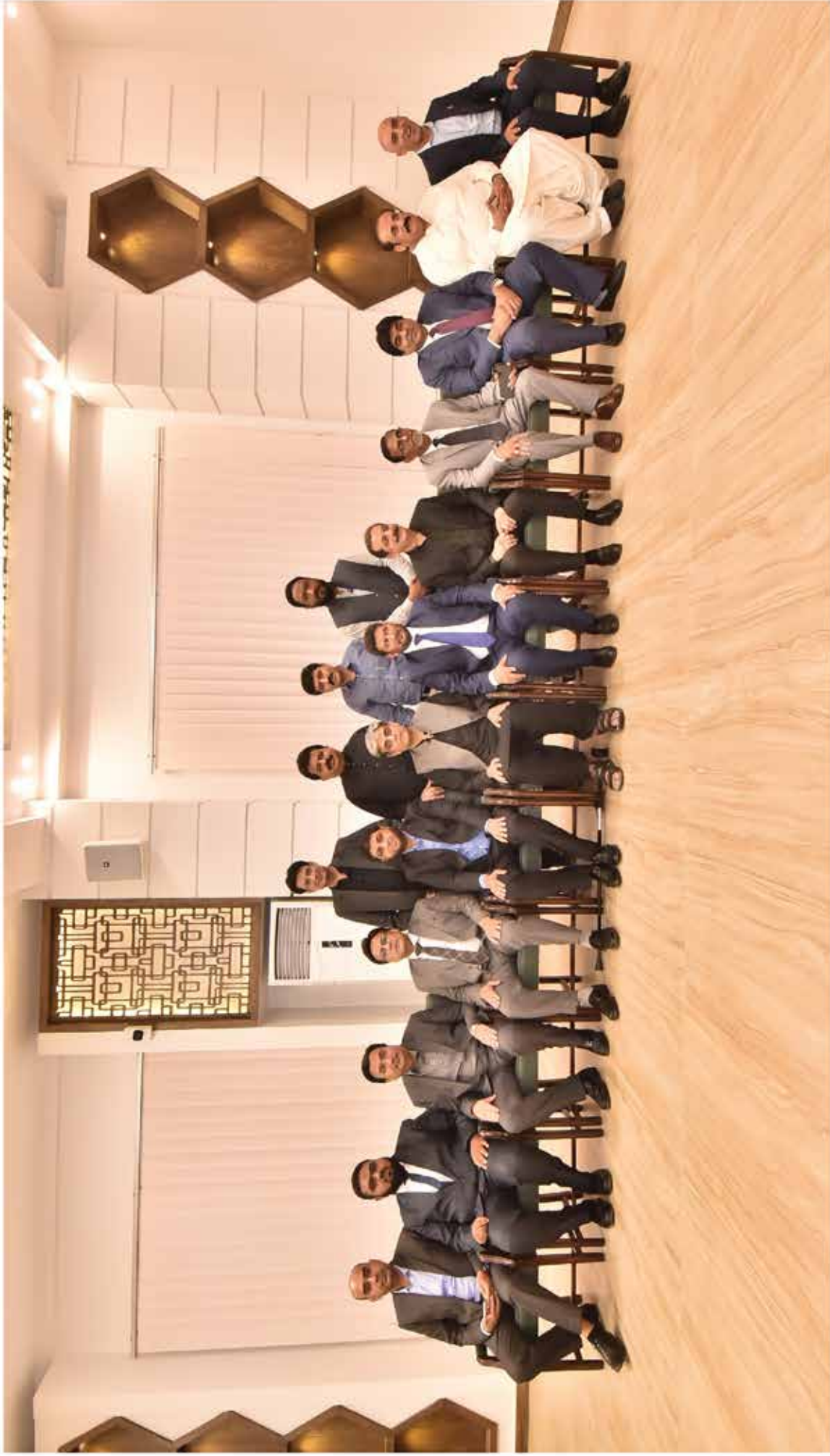
A group photo of outgoing office-bearers for the term 2018-19 along with newly-elected office-bearers for the year 2019-20 after Annual General Body Meeting at Jinnah Hall at ABAD House on Sept 30, 2019