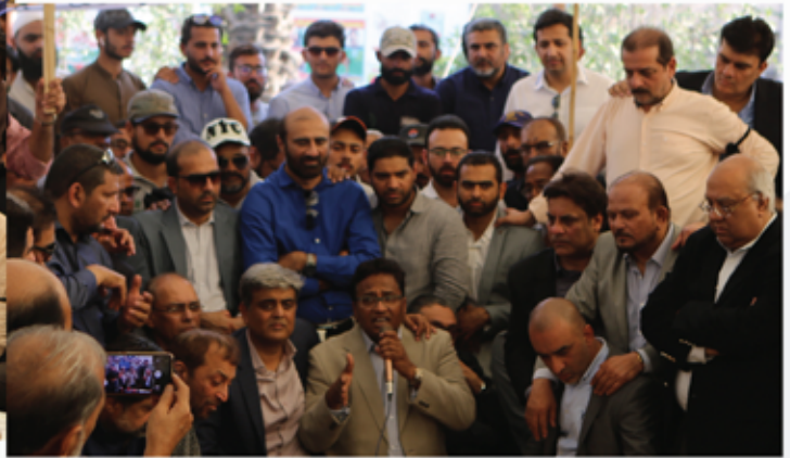
Managing Director KWSB meets ABAD office-bearers during the protest and assures resolution of problems.

Addressing the protest rally, Chairman ABAD