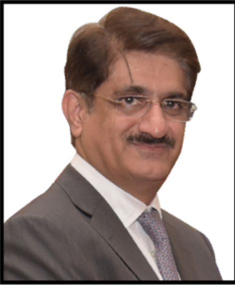
Syed Murad Ali Shah Chief Minister of Sindh