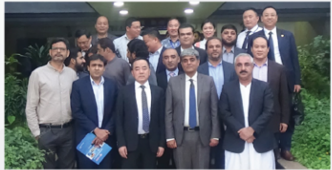
A group photo of Chinese trade delegation with ABAD office-bearers during the former's visit to ABAD House.