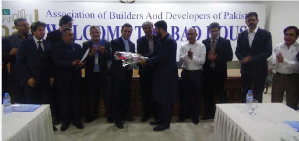
ABAD office-bearers present bouquet to Iranian trade delegation after a meeting.

"Both the sides discussed matters of mutual interest including boost in trade."