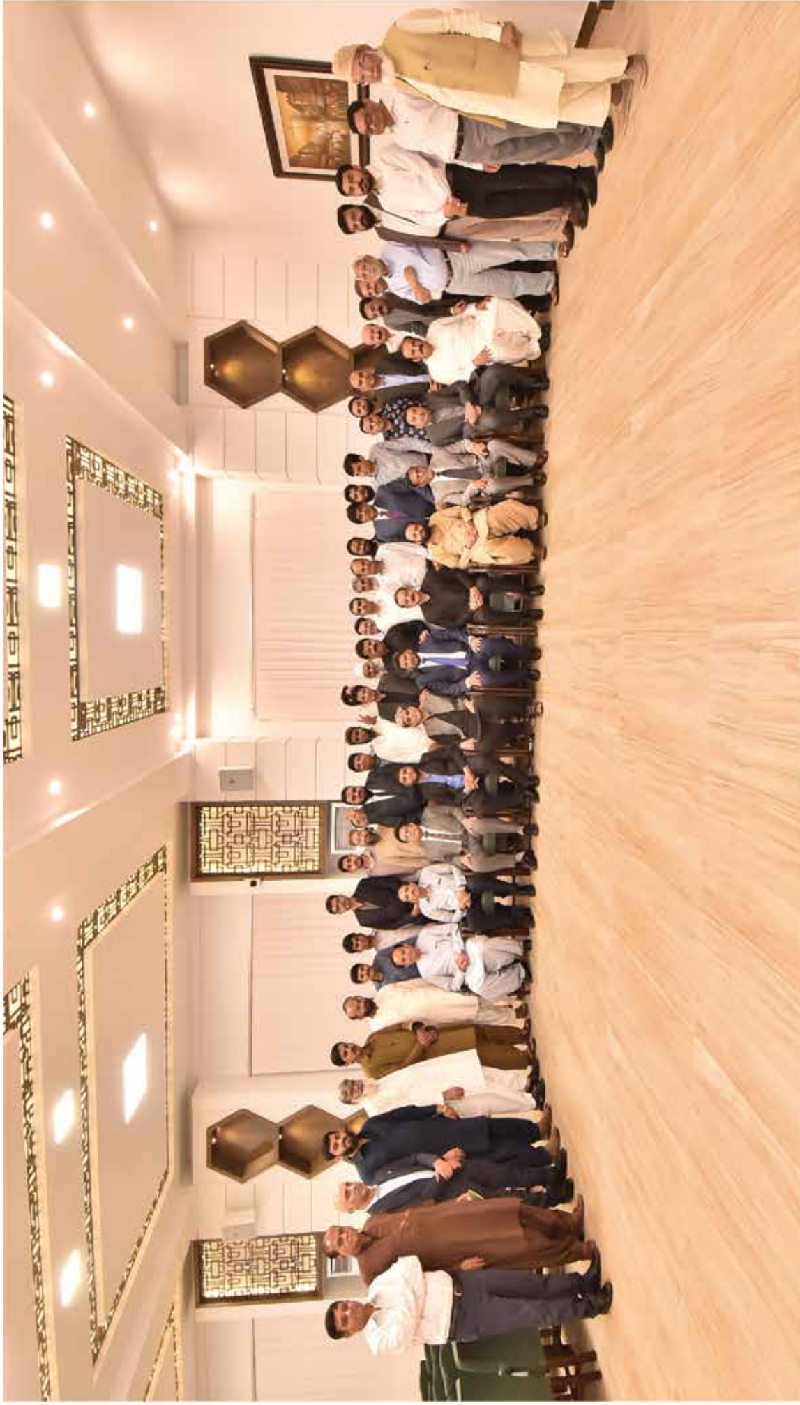
Outgoing office-bearers of 2018-19 with incoming office-bearers for the year 2019-20 flanked by a group of ABAD members after Annual General Body Meeting on Sep 30, 2019.