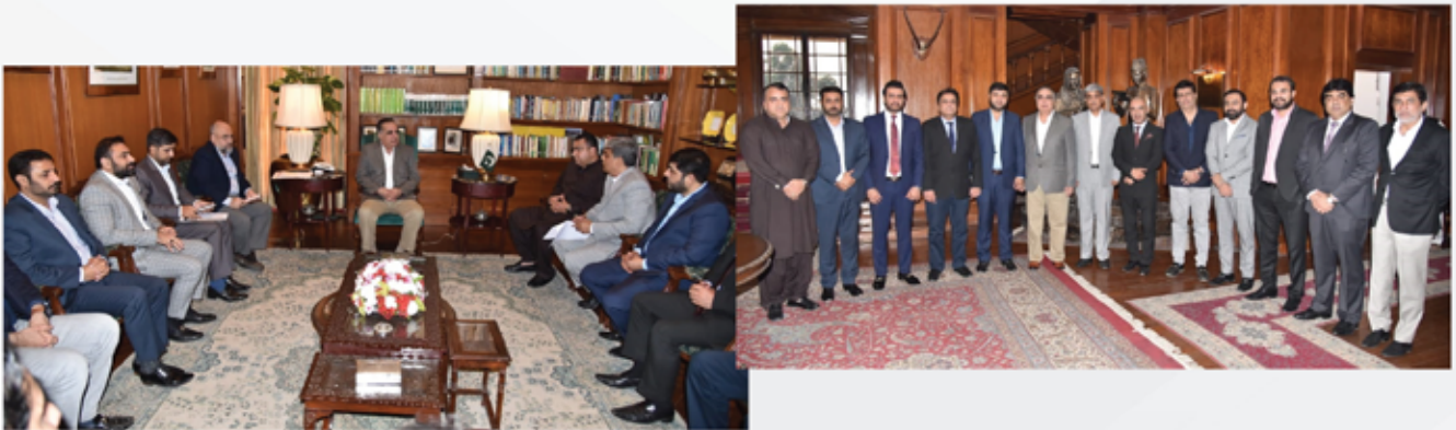
ABAD delegation meets Governor Sindh, Mr. Imran Ismail, at the Governor House.

The delegation conversed about a number of matters including a request to rope in ABAD for constructing the government housing scheme.