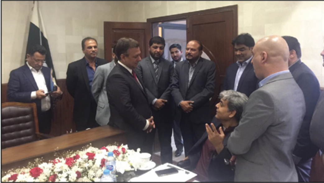
A delegation of ABAD with DG military Land & Cantonment Boards

Several matters came into discussion including obstacle in issuance of NOCs by Cantonment Boards