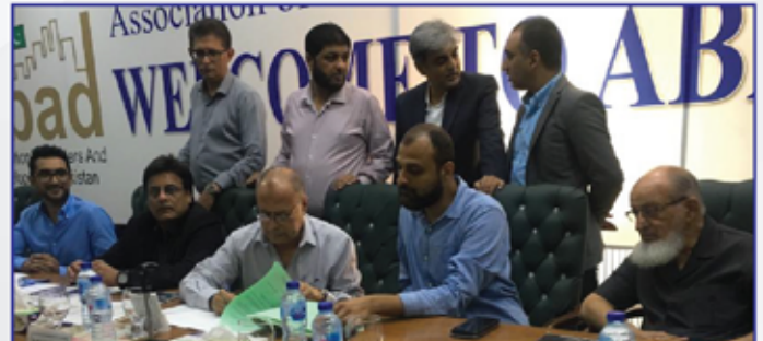
A glimpse of MoU-signing ceremonies between ABAD and different firms.

The Association of Builders and Developers of Pakistan (ABAD) inked memorandums of understanding (MoUs) with different firms in the tenure 2018-19.