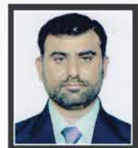
Mr. Tariq Aziz