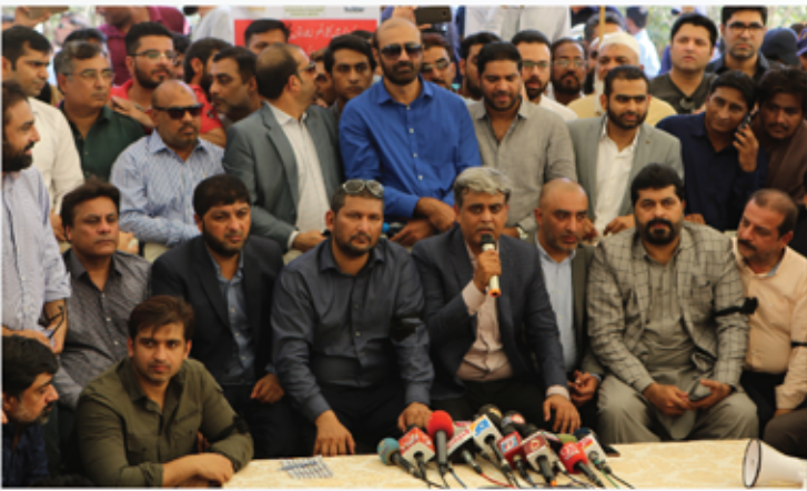
The high-ups of ABAD speak to the media during the protest demonstration.

of allied industries. All of them viewed that they were sailing on same boat with ABAD as due to unavailability of NOCs, construction activities have stopped in city, unemployment is rising and many allied manufacturing industries related to constructions have shut their units down.