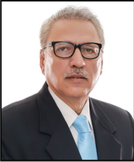
Dr. Arif Alvi President of Pakistan