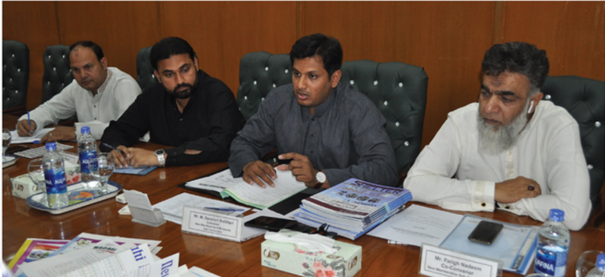
Members of New Membership and Renewal Sub-Committee speak to applicants during a meeting at ABAD House.

The New Membership and Renewal Sub-Committee conducted several meetings during its tenure to vet and approve a number of applications by aspiring members to join ABAD.