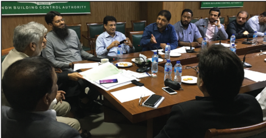
A delegation of ABAD holds meeting with Director General of SBCA at his office in August.

The Sindh Building Control Authority (SBCA) Sub-Committee of ABAD had a number of imperative tasks at hand, especially after the Authority issued an order, dated Jan 24, 2019, imposing blanket ban on construction activities of the city.