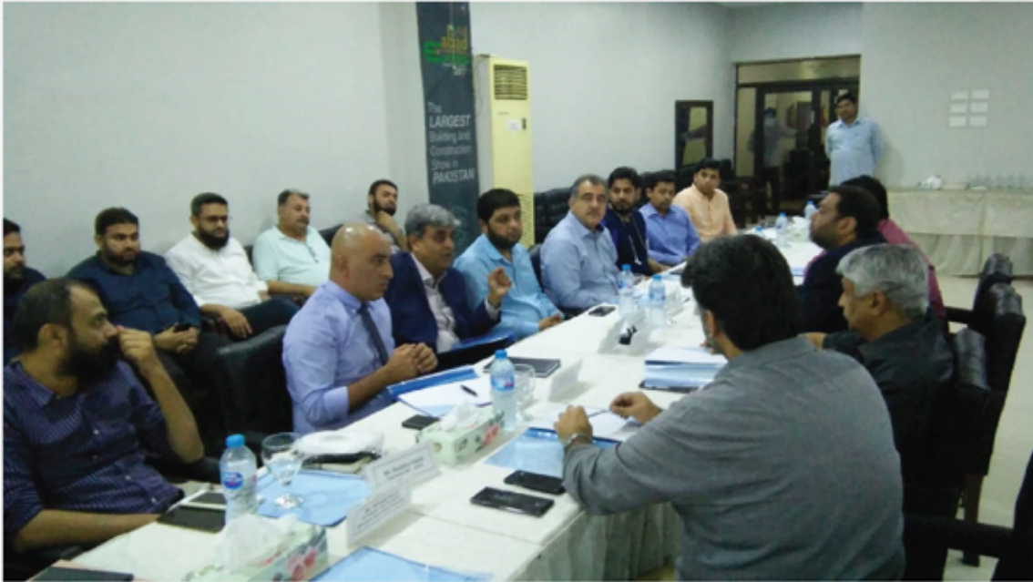
A delegation of TSA in conversation with ABAD office-bearers at ABAD House.

A delegation from International Industries Ltd. (IIL) arrived at the ABAD House on November 9, 2018 to sign a Memorandum of Understanding (MoU) with Association of Builders and Developers of Pakistan (ABAD).