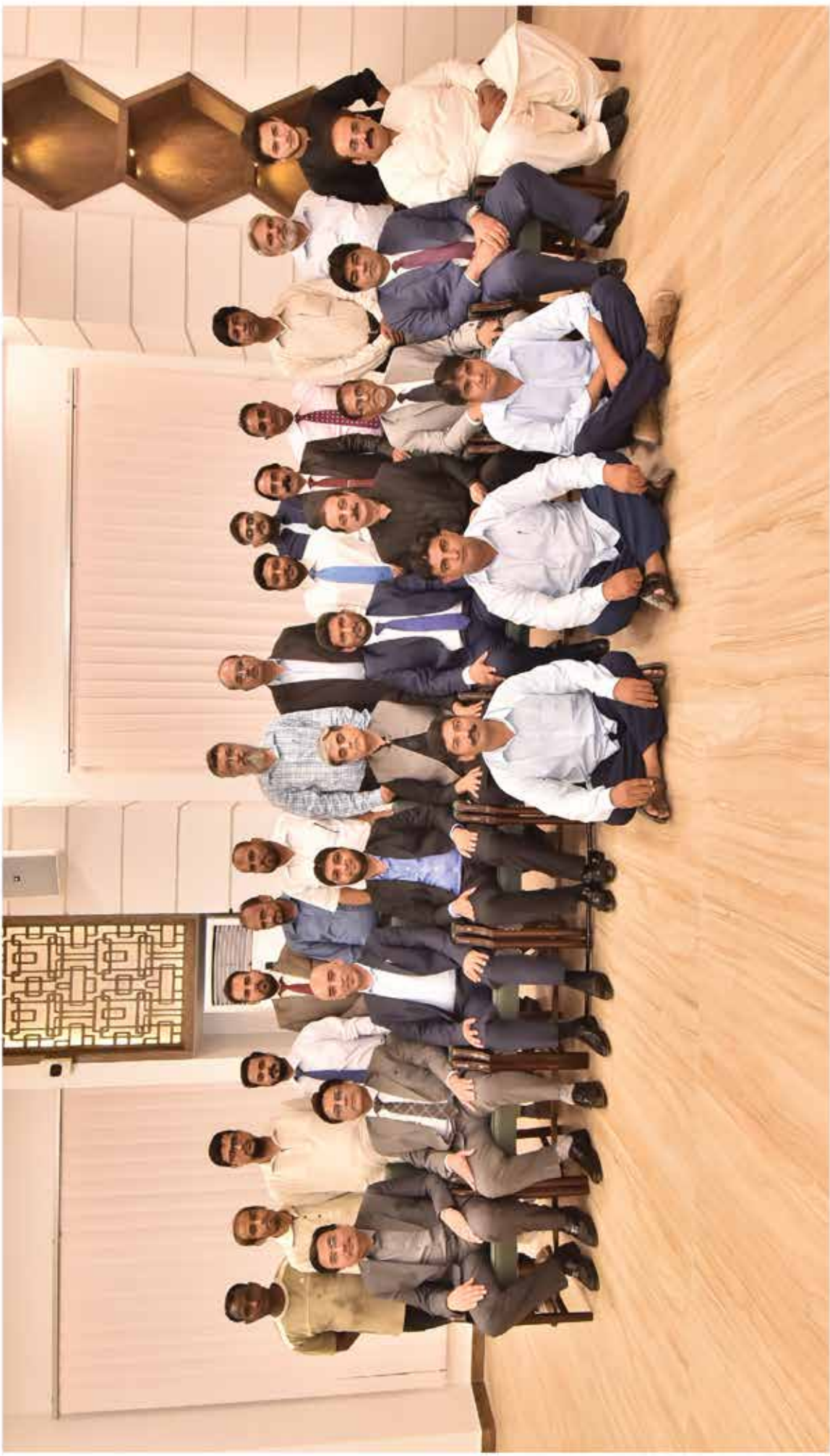
A group photo of outgoing office-bearers of 2018-19 with incoming office-bearers for the year 2019-20 along with staff members of ABAD Secretariat.