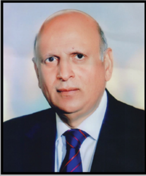
Ch. Mohammad Sarwar Governor of Punjab