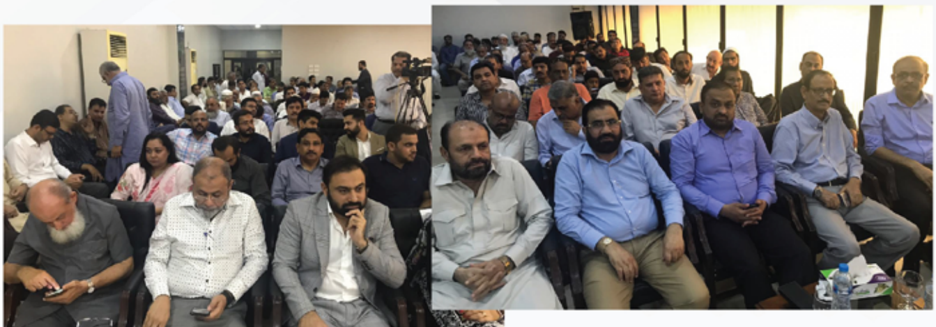
A glimpse of members attending the AGM.