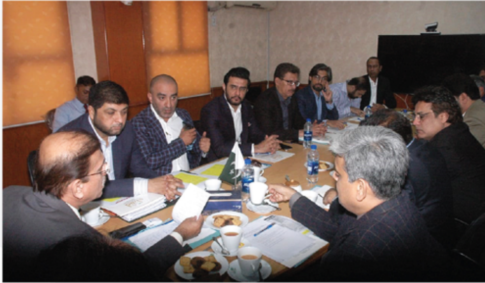
ABAD delegation in a meeting with Chairman Anti-Corruption Establishment at his office.

The meeting discussed notice published in newspapers regarding caution over constructions.