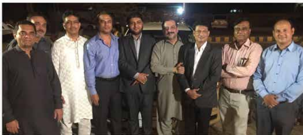
Members of ABAD photographed outside the newly-built Hyderabad sub-region office.