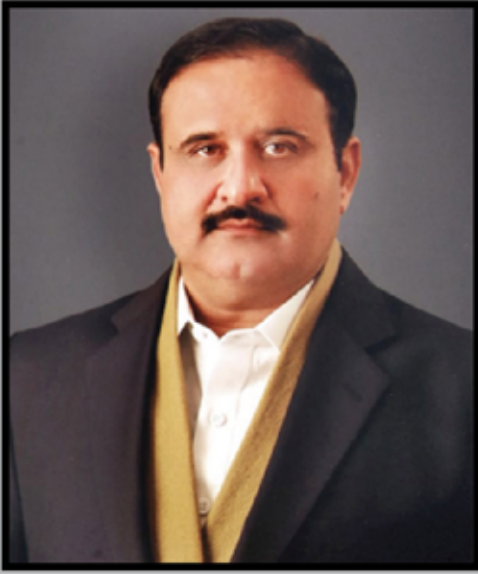
Sardar Usman Buzdar Chief Minister of Punjab