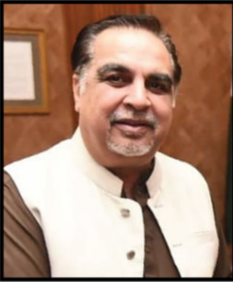
Imran Ismail Governor of Sindh