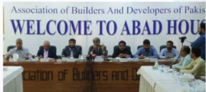
ABAD Chairman and other office-bearers hold press conference to public proposal regarding government housing scheme.

He, however, said the government should only facilitate this scheme while it is the private sector which has to execute and complete it. Therefore the Chairman of the Task Force of the Program should be from a