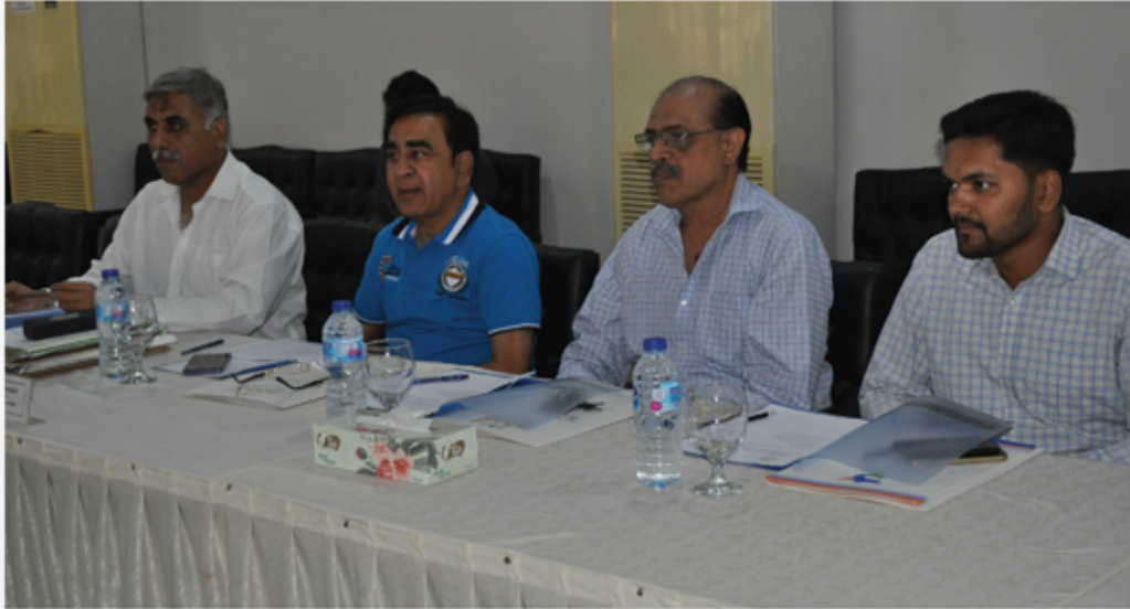
The KWSB Sub-Committee holds meeting at ABAD House to discuss pertinent issues.

Legitimate constructions in Karachi are often faced with unexpected obstacles owing to neglect at the end of relevant regulatory authorities. Builders face impediments in completion of projects when authorities like Karachi Water and Sewerage Board (KWSB) turn a deaf ear to requests forwarded by builders seeking no objection certificate (NOC) for their projects.