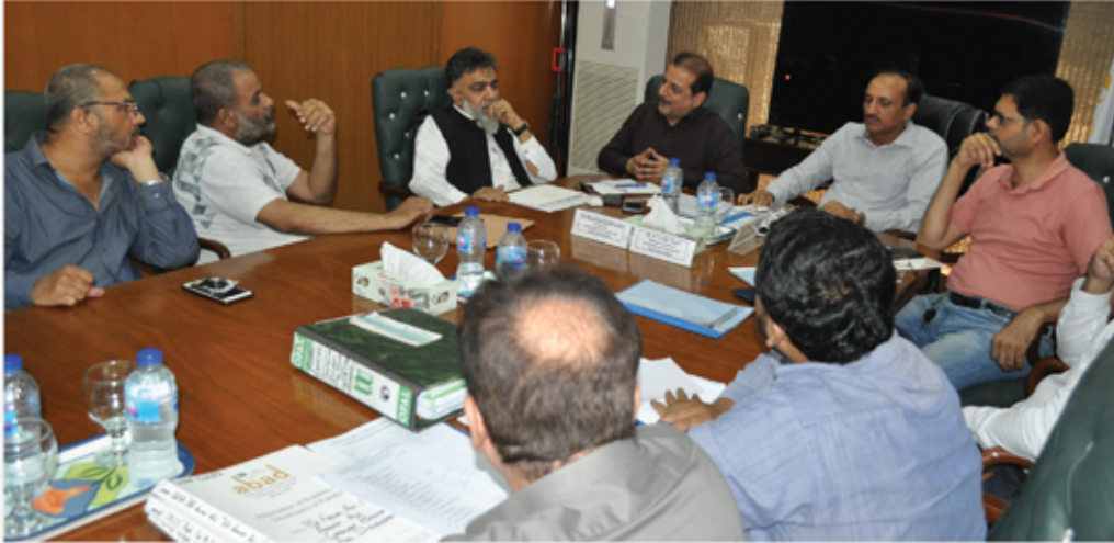
Members of Complaint & Arbitration Sub-Committee Sub-Committee hold meeting at the ABAD House.

The main objective of the Complaints Sub-Committee of ABAD is to resolve the complaints received against members of ABAD in coordination with the builder and complainant.